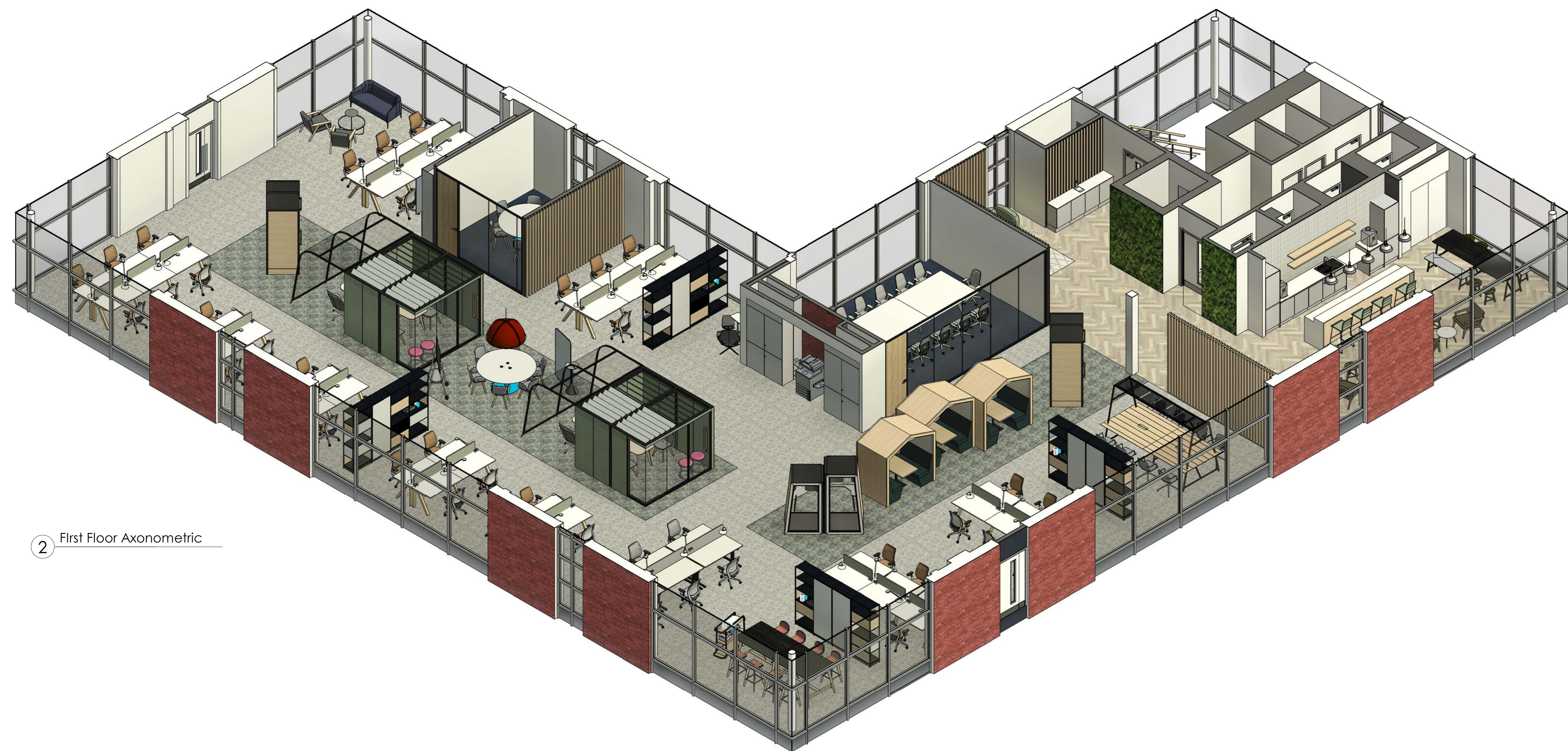
2 First Floor Axonometric