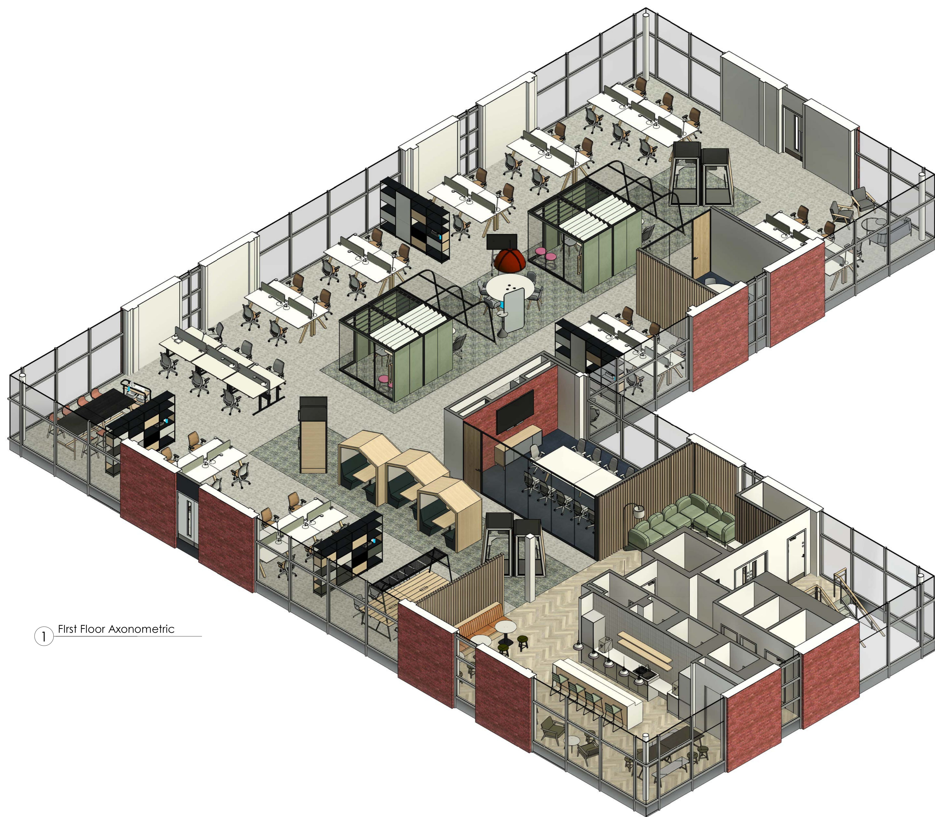
1 First Floor Axonometric